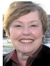
Former Auburn Mayor Lee Young