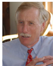
Former Governor Angus King